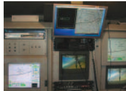
UAV Mobile Control Station equipped with Sentinel-SAVDS Display